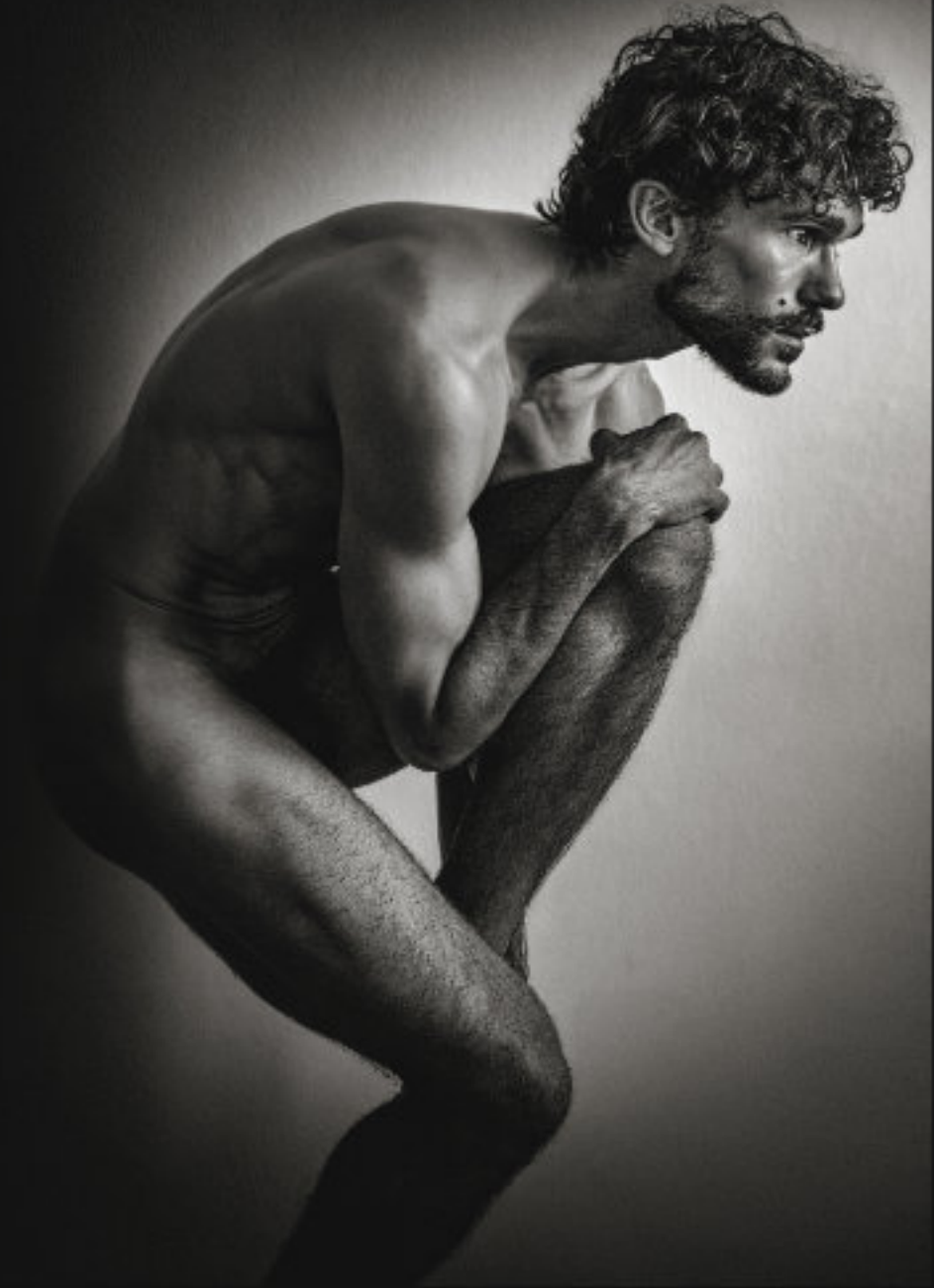
PAIN · THE DANCER