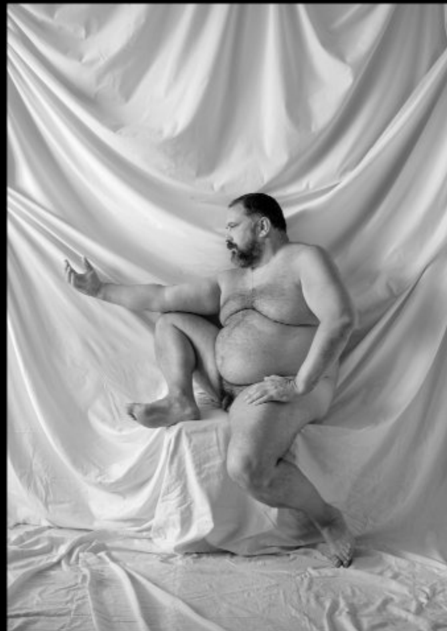
OCTOBER 16 2019 LIPFY