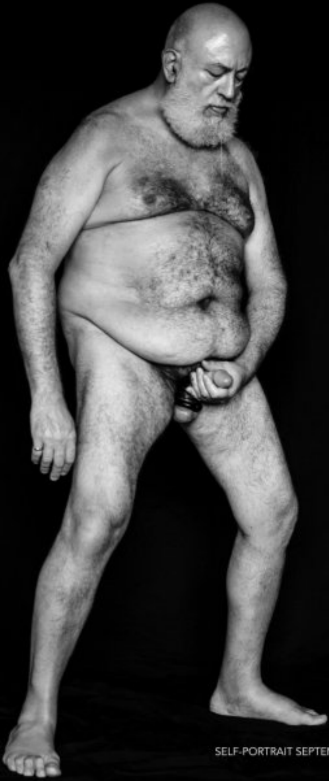
SELF-PORTRAIT SEPTEMBER 17 2020

www.gianorso.com www.flickr.com/photos/gianorso www.instagram.com/houseofgianorso