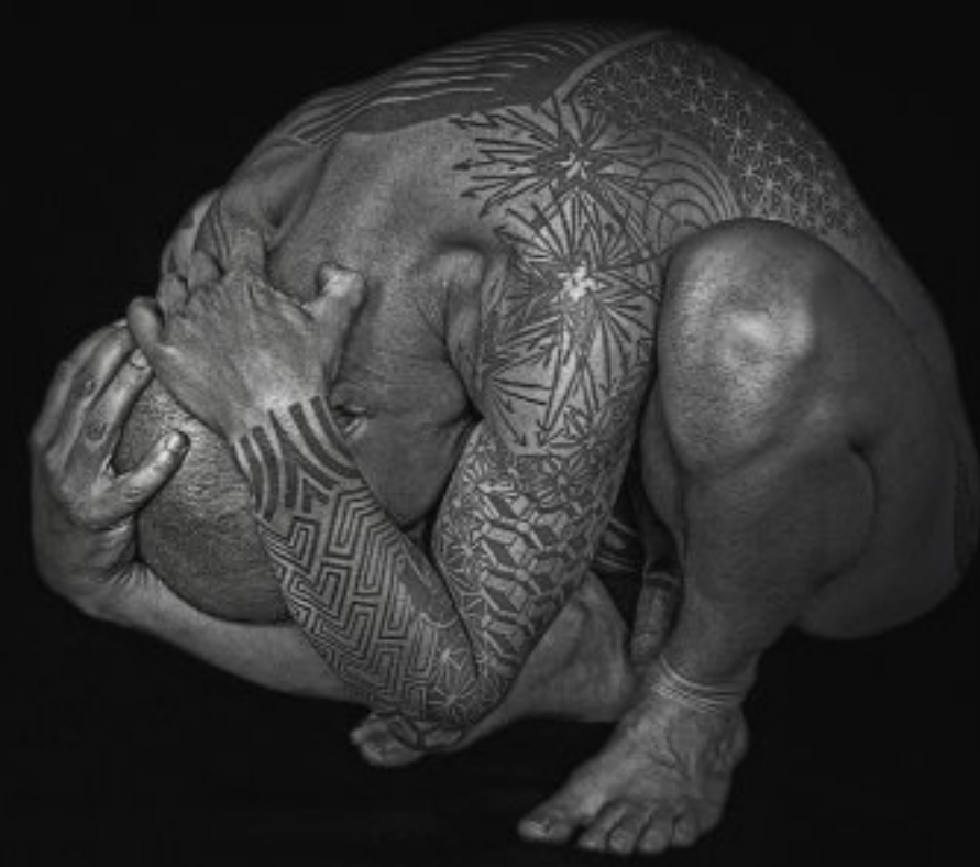
FACE TO FACE